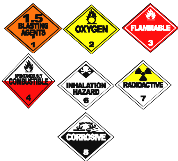
Examples of HAZMAT Placards. Figure 9.3

Placards. Placards are used to warn others of hazardous materials. Placards are signs put on the outside of a vehicle and on bulk packages, which identify the hazard class of the cargo. A placarded vehicle must have at least four identical placards. They are put on the front, rear, and both sides of the vehicle. See Figure 9.3. Placards must be readable from all four directions. They are at least 10 3/4 inches square, square-on-point, in a diamond shape. Cargo tanks and other bulk packaging display the identification number of their contents on placards or orange panels or white square-on-point displays that are the same size as placards.